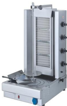
Shawarma Grill (Gas/Electric) Size: 2 To 4 Burner