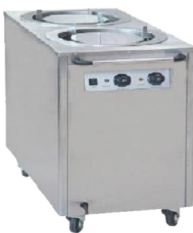
Plat Warmer (Electric) Single / Double Cap. 50 to 100 Plates