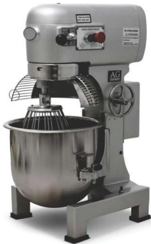
Planetary Mixer Cap. 5 to 80 ltr.