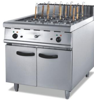
Pasta Cooker (Gas / Electric) Size : Customized