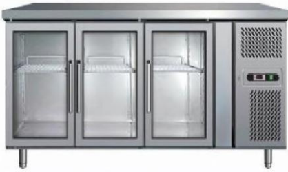
Glass Door Under Counter (Back Bar Chiller) Size : Customized