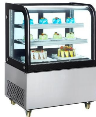
Bakery / Sweet Display Counter Size : Customized