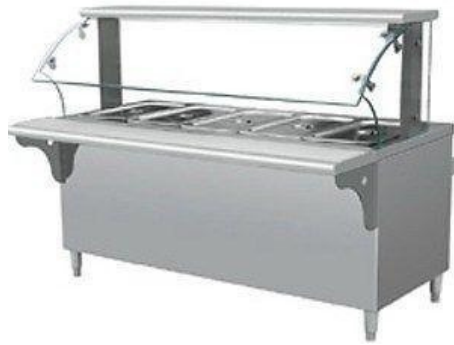
Hot Bain Marie with Sneeze Guard & Tray Slide Size : Customized