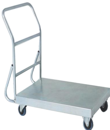
S.S. Platform Trolley Size : Customized