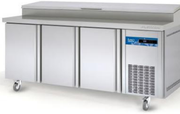
3 Door Under Counter (Pizza Makeline) Refrigerator / Freezer Size : Customized