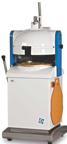
Dough Divider / Rounder (Electric)