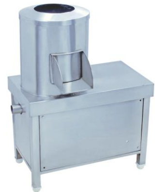
Potato Peeler (Electric) Cap. 5 to 50 kg.