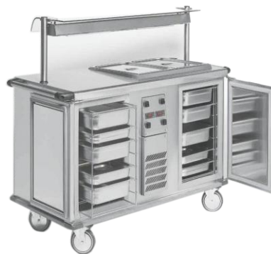
Hot Food Service Trolley Size : Customized