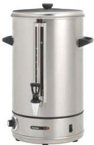
Water / Milk Boiler (Customised/Imported) Cap. 10 to 40 ltr.