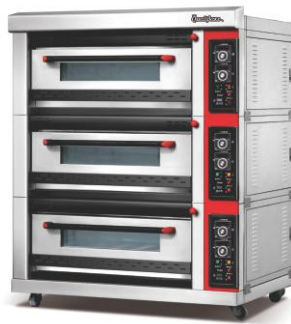
3 Deck Baking Oven (Gas / Electric)