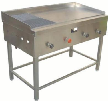
Chapati Plate With Puffer Size: Customized