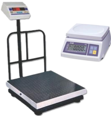
Weighing Scale Cap. 10 to 500 kg.