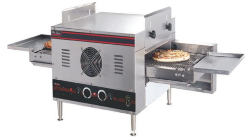
Conveyor Pizza Oven Electric / Gas Imported