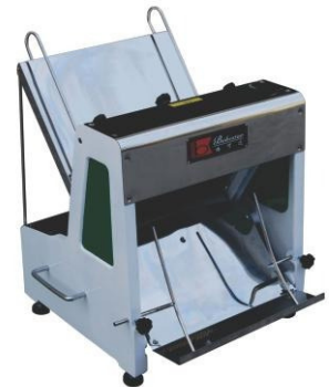
Bread Slicer (Electric) Table / Floor Model

CHANMAG / BERJAYA based on professional know-how with R & D manufacturer technique and satisfactory service attitude, to offer excellent bakery equipment, to contribute the bakery customers. Innovate to develop new product, enhance production technique improve product quality for providing more satisfactory product customers. Keep sincere & honest; identify right & wrong, harmonious to concern each other, to unit together, to develop benefit for share with customers' subcontractor, colleague, stockholder and publics in the country.