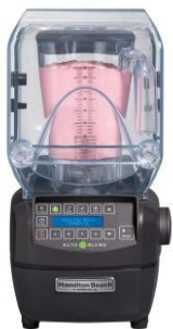
Commercial Summit Blender