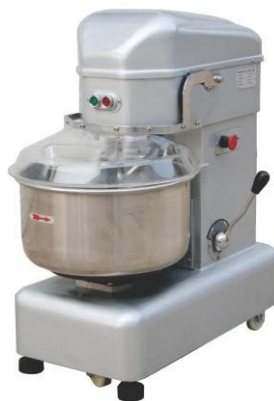
Spiral Mixer Cap. 5 to 80 ltr.