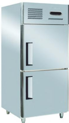
Vertical Two Door (Refrigerator / Freezer) Cap. 400 to 600 Ltr.