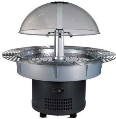
Salad Counter Size : Customized