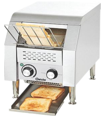
Conveyor Toaster (Electrical) (150 / 300 Slice)