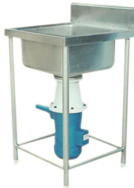
Garbage Crusher Cap. 1 to 5 HP