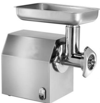
Meat Mincer (Electric) Cap. 20 to 150 kg. / hr.