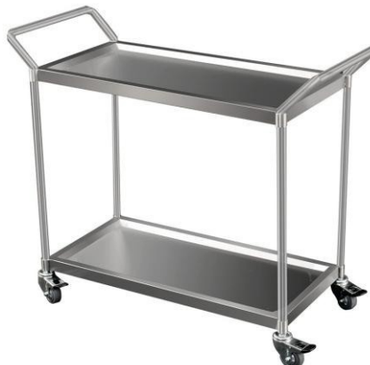
S.S Utility Trolley Size : Customized