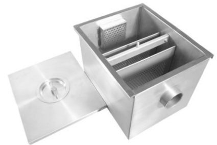
Greash Trap Customized