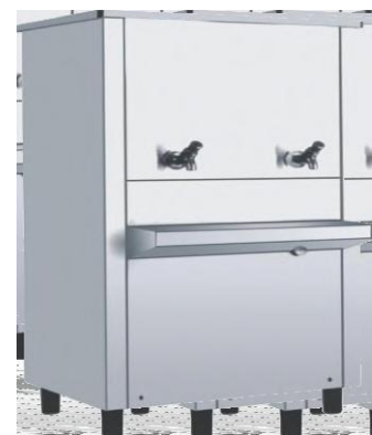
Water Cooler Cap. 25 to 1000 ltr.