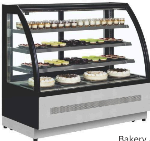
Bakery / Sweet Display Counter Size : Customized