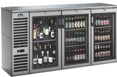
Three Door Back Bar Chiller Size : Standard (Imported)