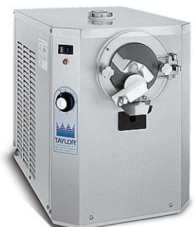
Model : 104

*size can be customized according to the customer requirement.