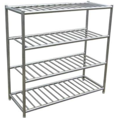
Pot Rack (Pipe Rack) Size : Customized