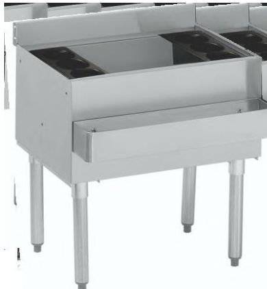
Cocktail Station with-Speed-Rail. Size : Customized