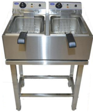
Deep Fat Fryer (Gas / Electric) Cap.: 8 to 20 Ltr.