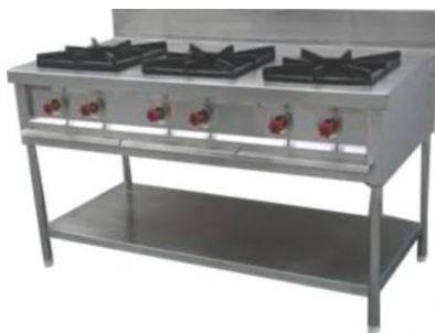
Three Burner Range Size: Customized