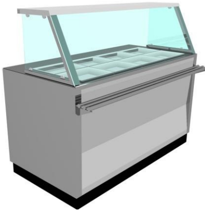
Bain Marie (Hot/Cold) Front Glass & Tray Slide Size : Customized