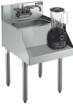
Blender Station with Sink & Tap Size : Customized