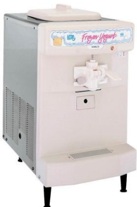
Model : 142