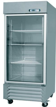
Visi Cooler Capacity : 300 to 500 ltr. (Branded)