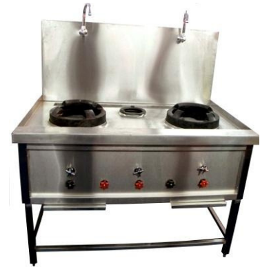
Three Burner Chinese Range Size: Customized