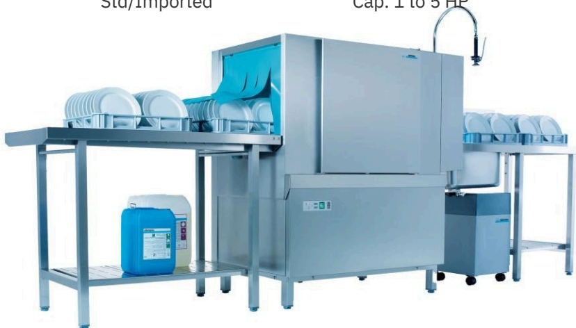
Rack Conveyor Dish Washer Cap. 155 Rack/hour