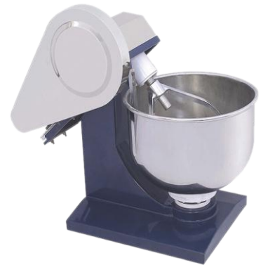
Dough Kneader (Electric) Cap. 5 to 100 ltr.