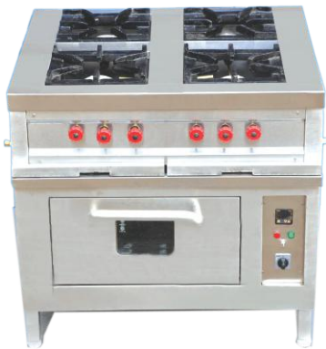
4 Burner Range With Oven Size: Customized