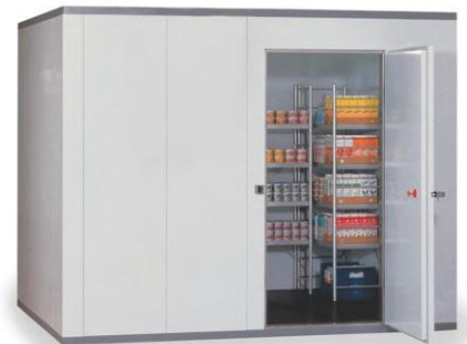
Walk in Chiller / Walk in Freezer Size : Customized