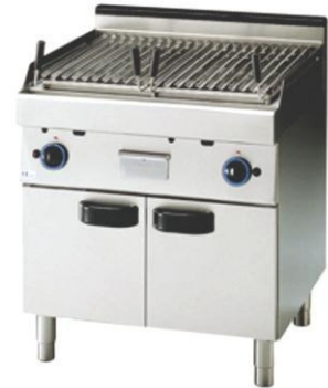
Lava Grill/Stone (Gas / Electric) SIZE: Customized/Important