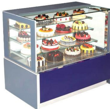
Bakery / Sweet Display Counter Size : Customized