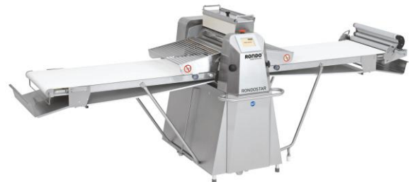
Dough Sheeter (Electric) Table / Floor Model