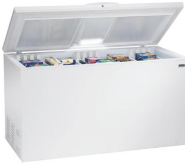
Chest Freezer (Deep Freezer) Cap. 100 to 1000 Ltr. (Branded)