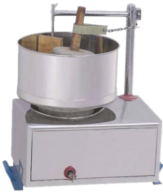
Wet Masala Grinder (Electric) Cap. 5 to 25 ltr.