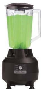
2 Speed Blender