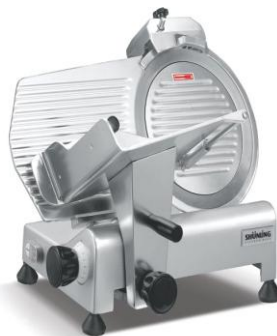
Meat Slicer (Electric) Slice : 150 to 300 mm