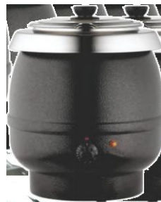
Soup Kettle Standard/Branded Cap. 7 to 15 ltr.