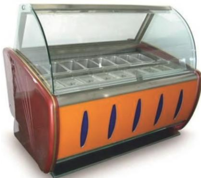
Ice Cream Parlor Size : Customized