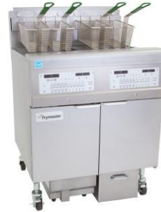
Deep Fat Fryer