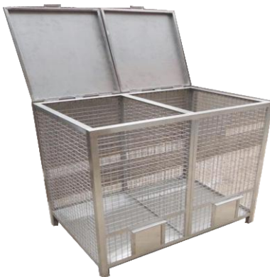
Onion / Potato Bin Size : Customized