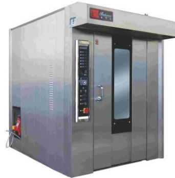
Rotary Oven (Gas / Electric)