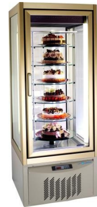
Vertical Display Counter Size : Customized