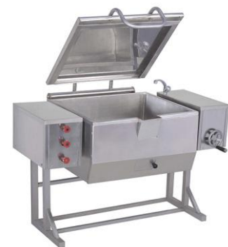
Tilting Brazing Pan Capacity : 50 To 200 Ltr.