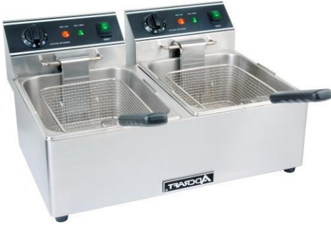
Deep Fat Fryer (Table Top) Single / Double Cap. 4 to 18 ltr.