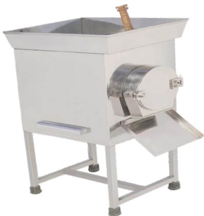
Pulverizer (Electric) Cap. 2 / 3 / 5 HP.