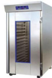
Proofing Chamber (Electric) Customized