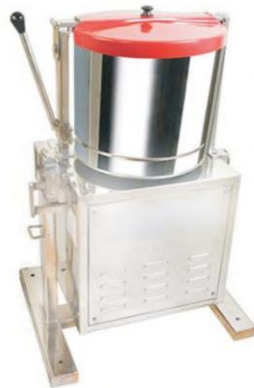
Tilting Wet Grinder (Electric) Cap. : 5 to 30 Ltr.