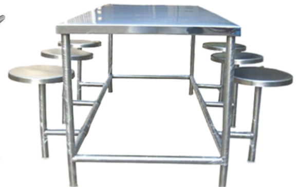
Dinning Table with Seater Size : Customized