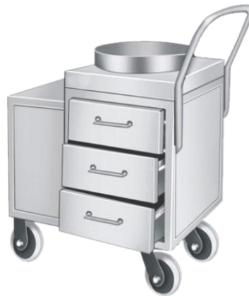
Tea Service Trolley Size : Customized