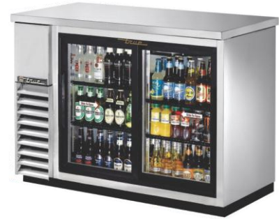
Two Door Back Bar Chiller Size : Customized (Imported)