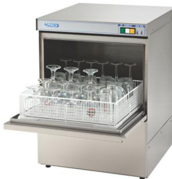
Glass Washer Cap. 30 to 40 Rack/h Size : Standard (Imported)