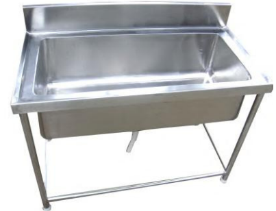
Pot Wash Unit Size : Customized