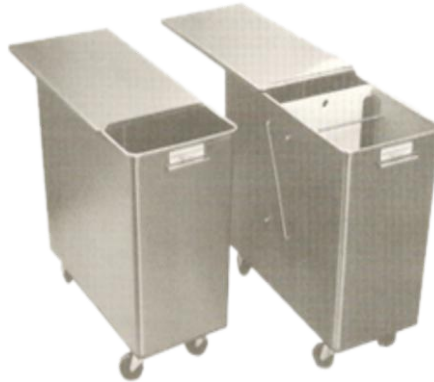
Ingredient Bin (Atta Bin) Size : Customized