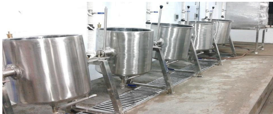
STEAM COOKING VESSELS WITH STEAM GENERATOR (GAS OPERATOR)

A special gadget is inducted in to the cooking field, for facility of boiling and cooking huge quality of Rice, Dal, Milk, Vegetables, Sambar, Rasma, Soups, Meat and so on.