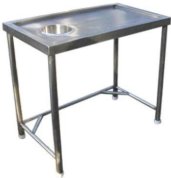
Dirty Dish Landing Table Size : Customized