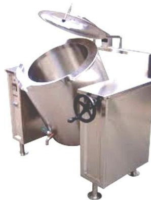
Bulk Cooker (Rice Boiler) Capacity : 50 To 250 Ltr.