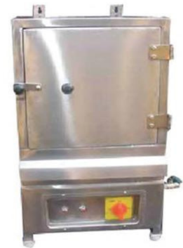
Idli Steamer (Gas / Electric) Cap. : 36 to 250 Itli