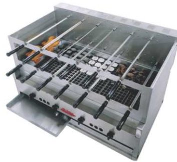
Charcoal Grill (Charcoal / Gas / Electric) Size: Customized