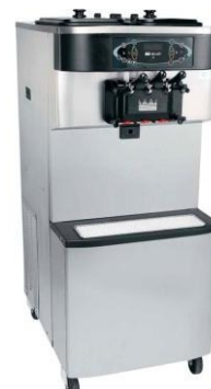
Model : C712 / 713