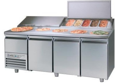
Under Counter (Pizza Makeline) Refrigerator / Freezer Size : Customized