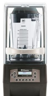
The Quiet Blender