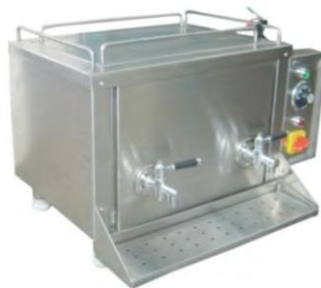
Tea Milk Dispenser (Size : Customised)