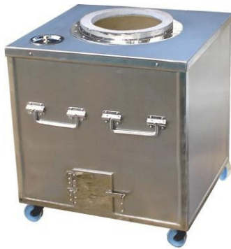
SS Mobile Tandoor (Gas / Charcoal) Size: Customized