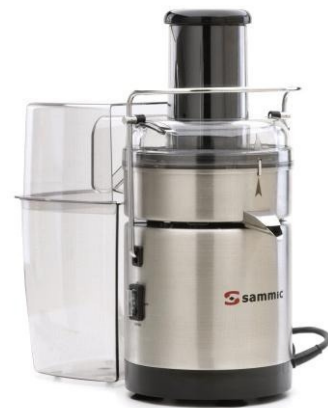
Licuadora Multi Juicer