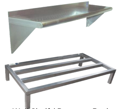
Wall Shelf / Dunnage Rack Size : Customized