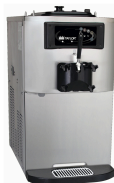
Model : 706