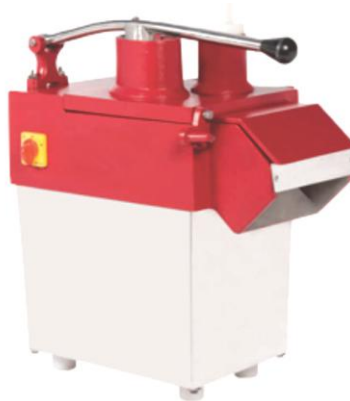
Vegetable Machine (Electric) Cap. 40 to 200 kg./hr.