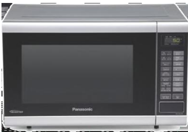
Microwave Oven Branded Cap. 15 to 30 ltr.