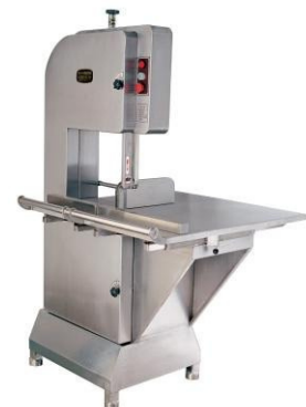
Bone Saws (Electric) Blade : 16/20 mm