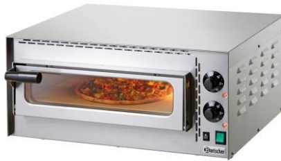
Pizza Oven Electric / Gas (Customised/Imported)