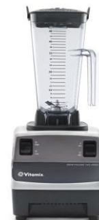
2 Speed Blender