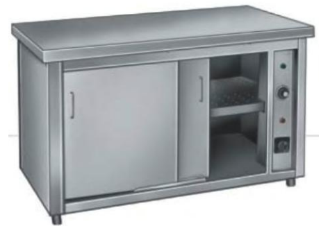
Hot Food Pick up Counter Size : Customized