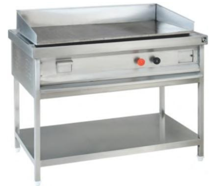
Dosa Plate Size: Customized