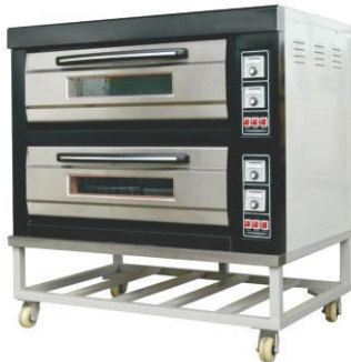
2 Deck Baking Oven (Gas / Electric)