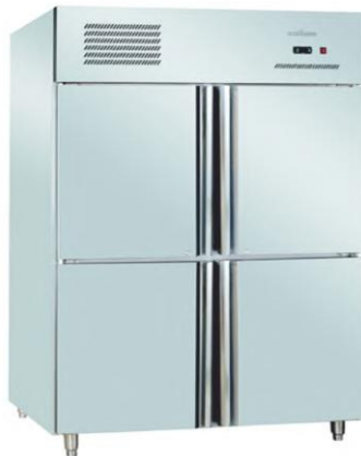
Vertical Four Door (Refrigerator / Freezer) Cap. 800 to 1200 Ltr.