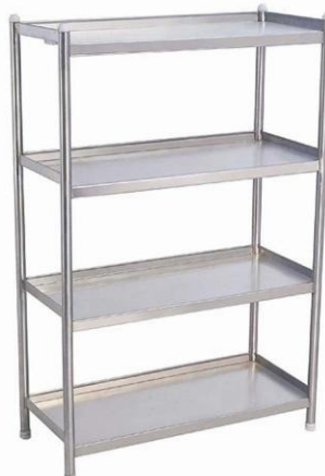
Storage / Clean Dish Rack Size : Customized