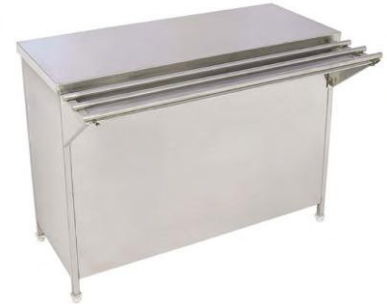
Cutlery Counter with Tray Slide Size : Customized