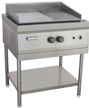
County Grill (griddle Plate) Size: Customized