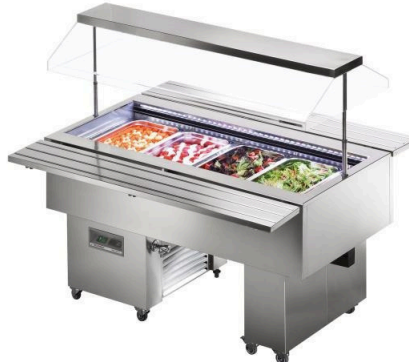
Salad Counter Size : Customized