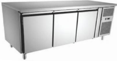
3 Door Under Counter Refrigerator / Freezer Size : Customized