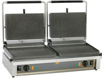
Sanwich Griller (Electric) Single / Doble (STD/Jambo)