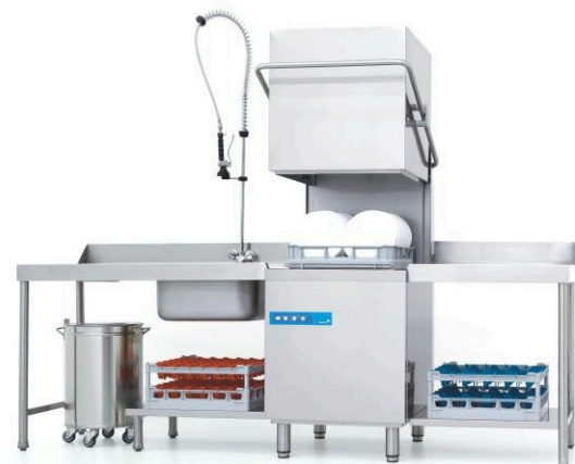
Hood Type Dishwasher Cap. 60 Rack/hour

Dishwasher range is ideal for high volume catering & hospitality dishwashing perfect for the busy commercial kitchenware washing area √ Under counter Dish & glass washer √ Hood Type Dishwashing Machine √ Rack Conveyor Dishwashing Machine