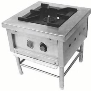
Single Burner Range Size: Customized