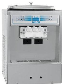
Model : 161