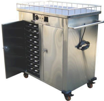
Hot Food Service Trolley Size : Customized