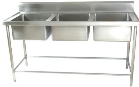
3 Sink Dish Wash Unit Size : Customized