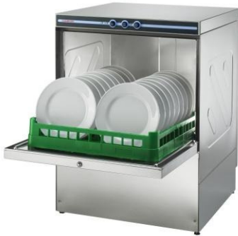
Under Counter Dishwasher Std/Imported