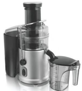
Juicer Mixer Standard/Imported